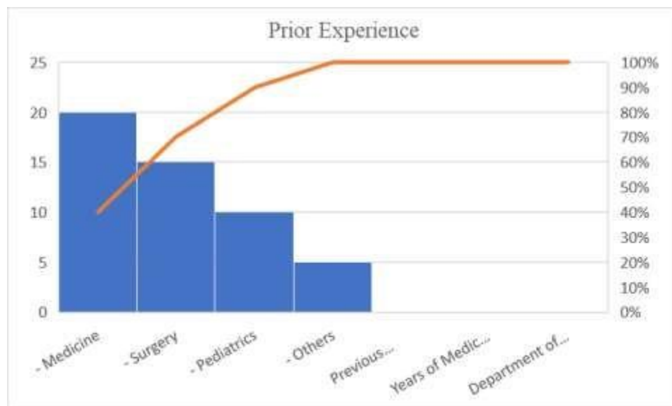
Figure 1: Educational Background and Prior Experience

There was no significant difference between the trained (Group T) and untrained (Group U) groups regarding age ( p=0.279 ) and sex distribution ( p=0.539 ). Both groups had a similar mean age and gender composition, ensuring comparability for subsequent analyses.